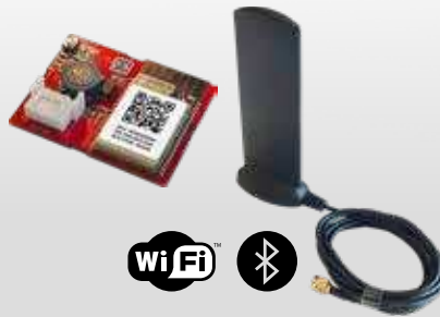
WIFI MODULE + ANTENNA